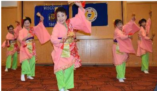
Members of the Minami Gyotoku Hanagumi