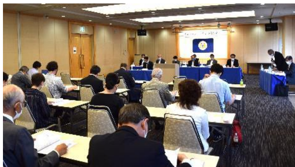
Annual General Meeting