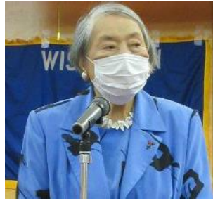
Former Chiba Governor Akiko Domoto