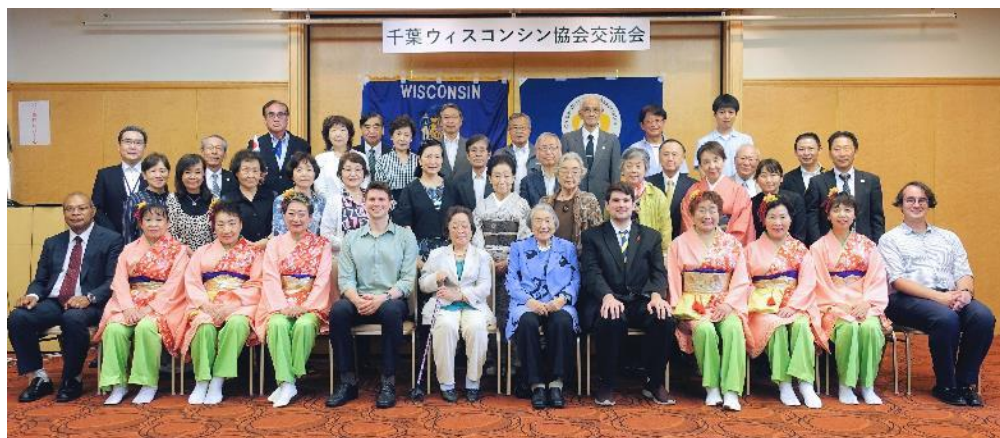
Commemorative Photo of Participants