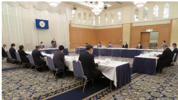
Board of Directors Meeting