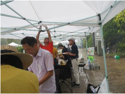
Taking cover from the rain under the tents

December 22, 2023 (original Japanese version)