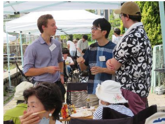
Lively conversation with delicious food