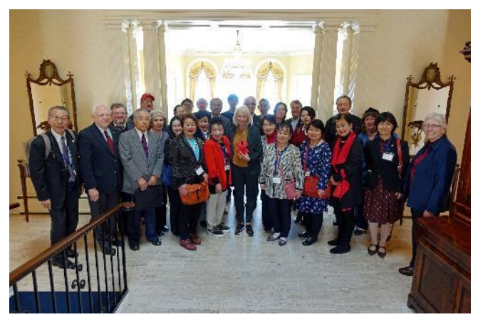
Visit to the State Governor's Residence, 2019