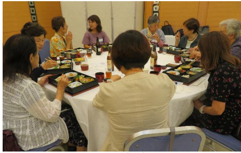
During the dinner