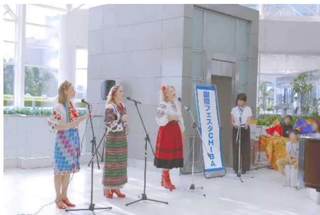
At International Festa CHIBA

The CWA panel provided basic information such as the location of Wisconsin and highlighted the sister state exchange with Chiba Prefecture that began in May 1990. It also introduced the dispatch of a Goodwill Delegation centered around students from Chiba Prefectural Sawara High School this fall.