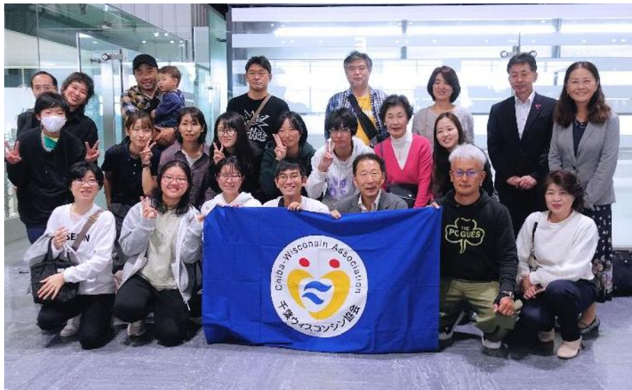
Departing from Narita International Airport, Saturday, October 26