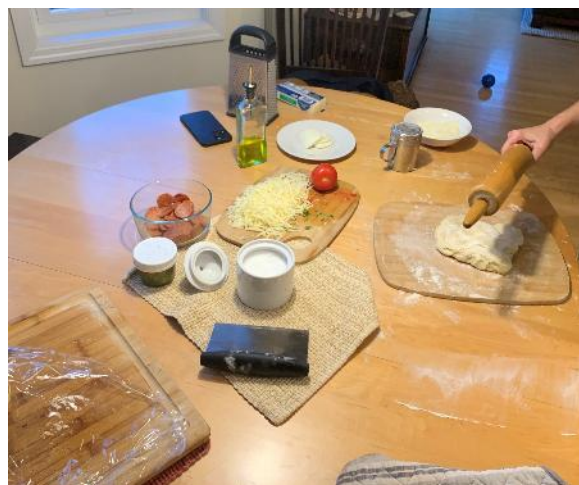
Making homemade pizza