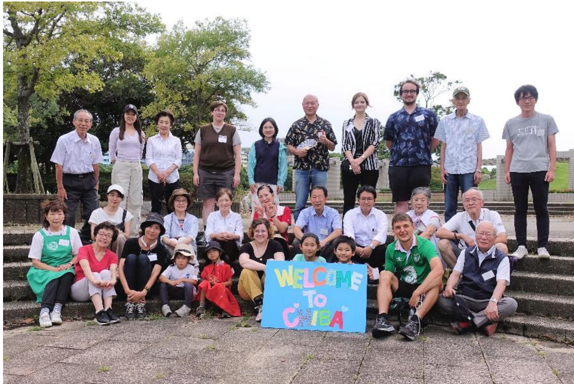
Group photo at the end of the event