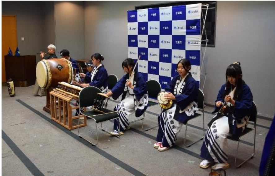
Performing Sawara Bayashi in front of Governor Kumagai

December 20, 2024 (original Japanese version)