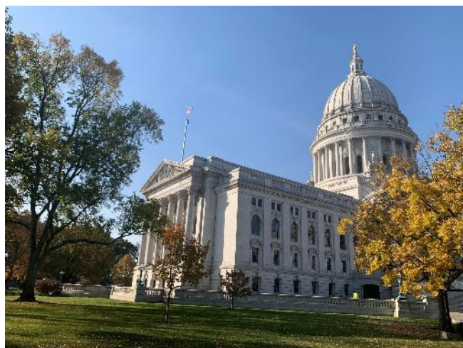
Fall at the Wisconsin State Capitol

With our visit taking place less than a week before a highly contentious presidential election, the tension in the air was palpable, and voter mobilization was in full swing, particularly on the University campus. Despite this backdrop of uncertainty and anxiety, however, Wisconsin was as warm and welcoming as ever.