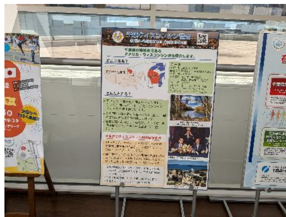
The CWA panel