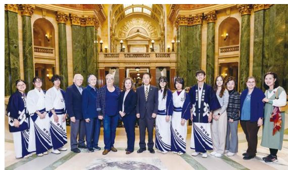
With Lieutenant Governor Sara Rodriguez

*A video of the delegation is available on the CWA website ( https://chiba-wisconsin.net/ )