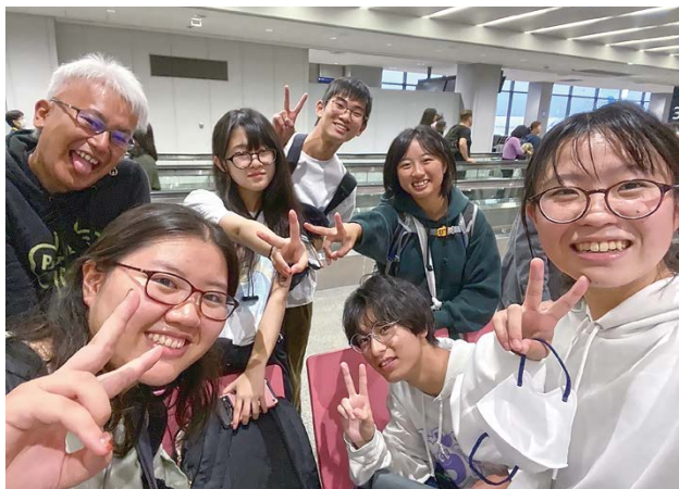
At Newark Liberty International Airport on the way home