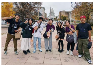
In front of the Wisconsin State Capitol

One of the things we discussed many times was the challenge of "How can we make people overseas enjoy Sawara Bayashi?" Rather than simply performing our usual routine, we devised various approaches tailored to our own style for the