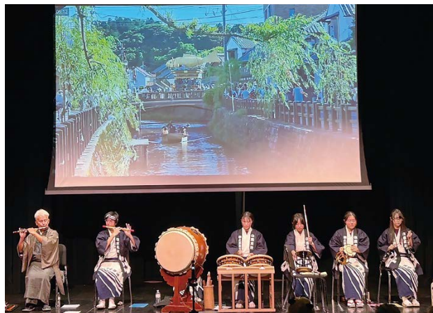
Final performance at Oakwood Village