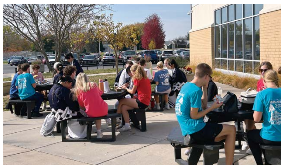
Lunch with the students at Stoughton High School