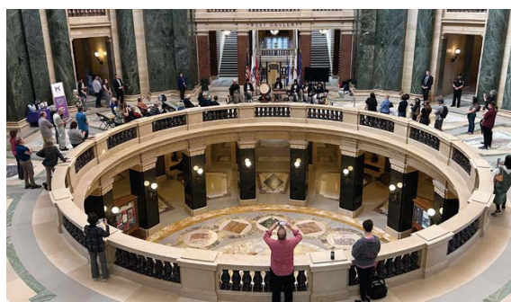
Performing at the Wisconsin State Capitol