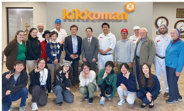
At the entrance to Kikkoman Foods, Inc.

I would also like to add that, as it was just before the U.S. presidential election, candidate Kamala Harris visited Madison and candidate Donald