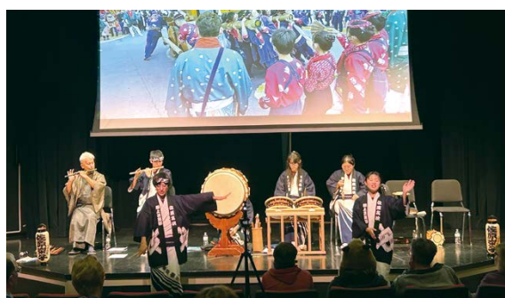
Performing at Oakwood Village