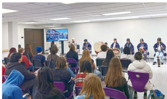
Performing at Madison East High School

10/27 Wisconsin Youth Symphony and Orchestra 10/28 Madison East High School 10/29 Stoughton High School 10/30 Wisconsin State Capitol 11/1 Oakwood Village