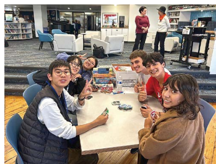
Exchange with the students of Madison Country Day School