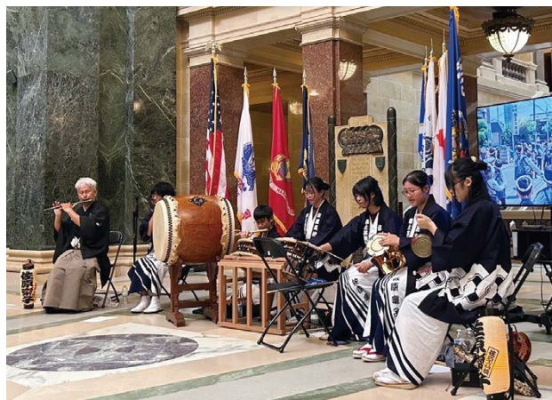
Performance at the Wisconsin State Capitol