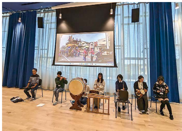
First performance at the Wisconsin Youth Symphony Orchestra