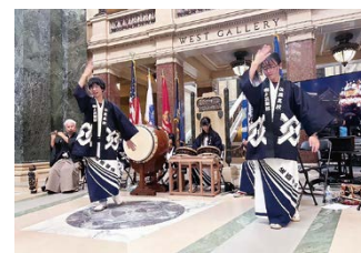
Performing at the Wisconsin State Capitol

Beyond the performances, we were taken to many different places, making for a very fulfilling nine days. Being in a new place where a different language was spoken, I truly realized the importance of actively striking up conversations, trying new things, and carrying myself confidently without fear, no matter the setting. This overseas trip was an excellent opportunity that allowed me to grow significantly as a person!