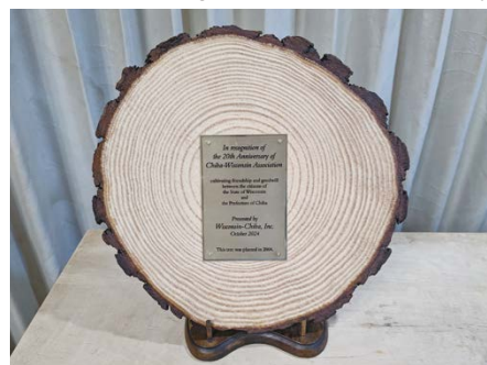
CWA 20th anniversary commemorative plaque

We received generous support from host families and many volunteers in the local community. I would also like to express my gratitude once again to the Katori City International Association and the teachers at