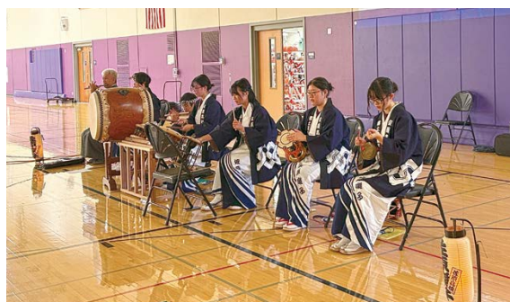
Performing at Stoughton High School