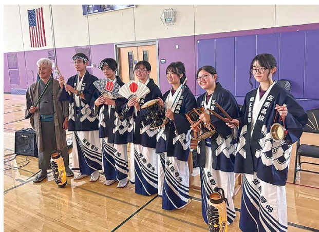
After the performance at Stoughton High School