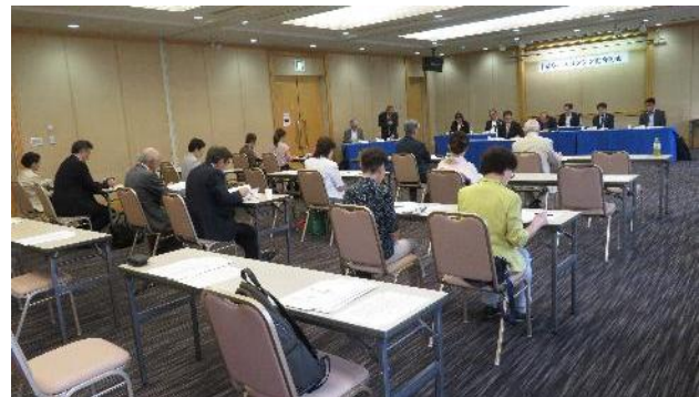
Annual General Meeting