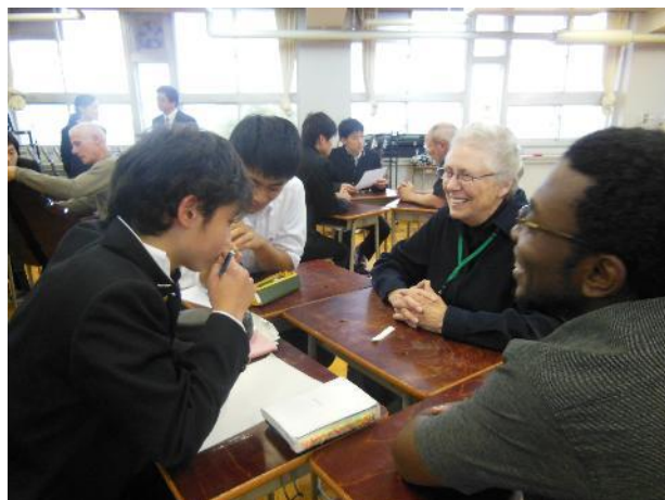
November 2014: Exchange with high school students at Chiba Prefectural Chosei High School