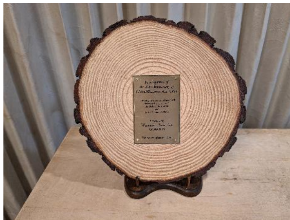
October 2024: Commemorative plaque for the 20th anniversary of CWA's establishment