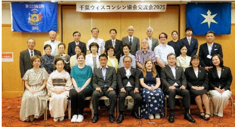
Commemorative photo with all participants

August 28, 2025 (original Japanese version)