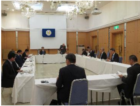
Board of Directors Meeting