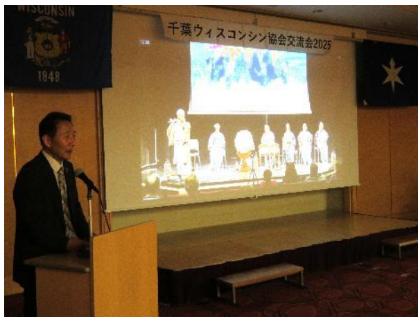
Video showcasing the Wisconsin visit